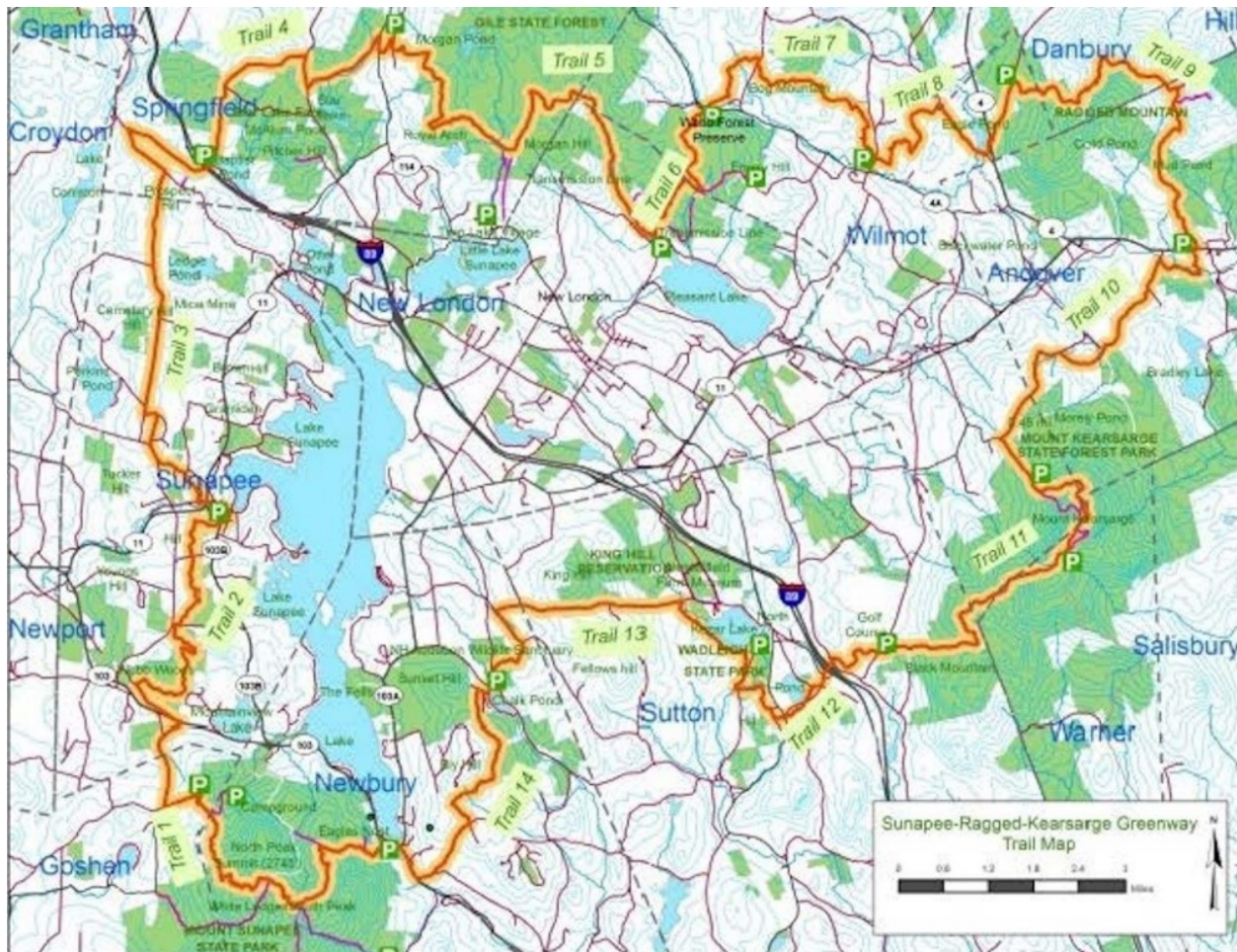
Figure 1: Map of the entire SRKG Trail www.srkg.com

The general color map accompanying this article puts the SRKG trails into perspective.