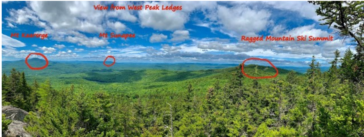
Figure 4: The Panoramic View from the Ledge on West Peak.

each of the three mountain peaks. There in front of us is the entire SRK Greenway 75-mile loop!