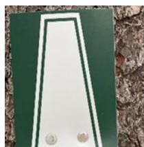
Figure 2: SRKG Trapezoid Trail Blaze

The unique SRKG trail marker, some may call it a trail blaze, is often referred to as the "trapezoid" because of its unique design. This "trapezoid" marker has kept me on the trail for all 75 miles. If the trapezoid was not within sight, it was time for me to stop, look around, and maybe backtrack until I located it. It was my safety net, "I was on the trail