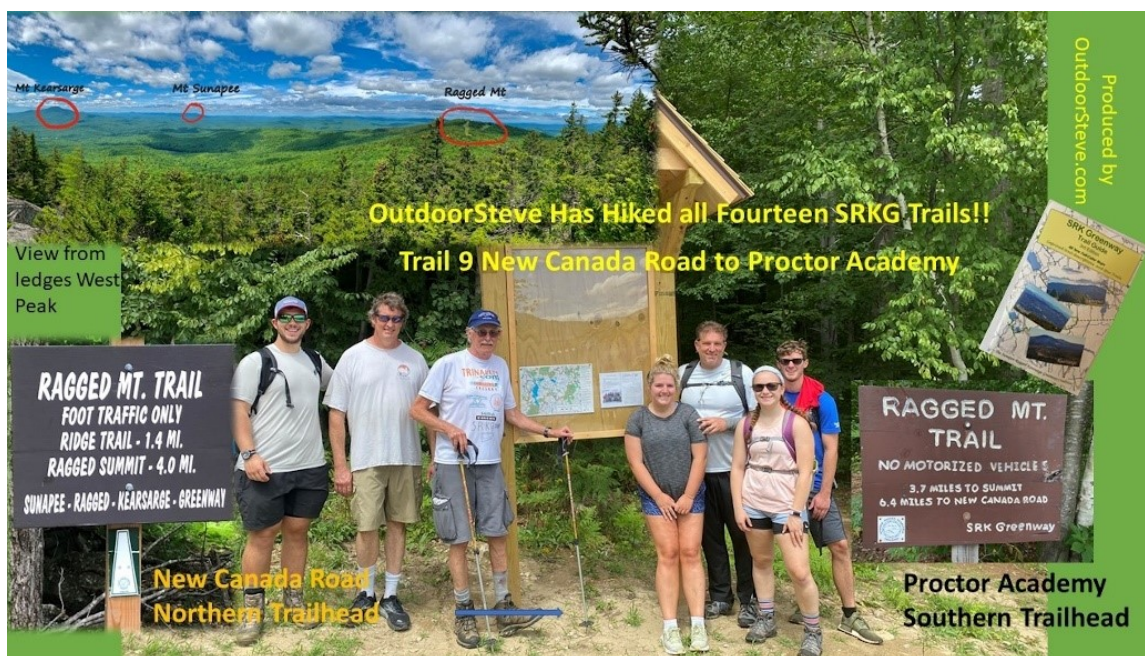
Figure 6: Celebration at Proctor Academy Trailhead

My recent book, Hiking New Hampshire's Sunapee-Ragged-Kearsarge Greenway Trail , supplements the SRKG Trail Guide with an introduction and video for each of the fourteen trail hikes. The videos give you a "what it feels like" to hike the SRKG, while the Guide remains the continual reference with maps and content for locating a trailhead, when to turn, and where you exit the trail. I used this Guide to stay on the path when turns were not readily visible and locate recommended spur trails for additional enjoyment and education. One spur trail is the Trail 9 Overlook on West Peak described above.